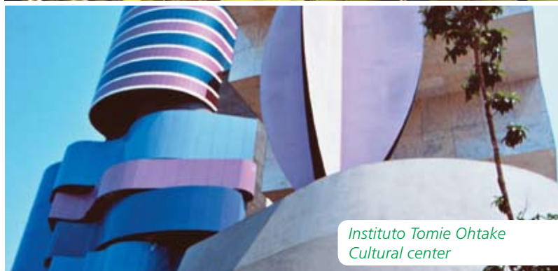
Instituto Tomie Ohtake Cultural center