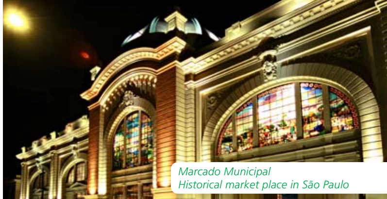
Mercado Municipal Historical market place in São Paulo

The companion fee of €130 includes access to the opening and closing ceremonies, the welcome reception and conference banquet.