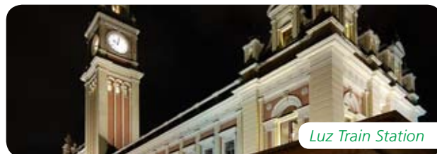
Luz Train Station